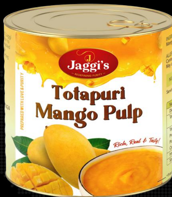
Totapuri Mango Pulp