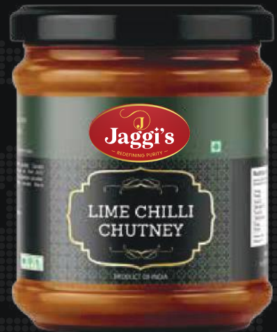
Lime Chilli Chutney