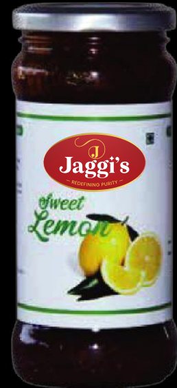
Sweet Lemon Pickle