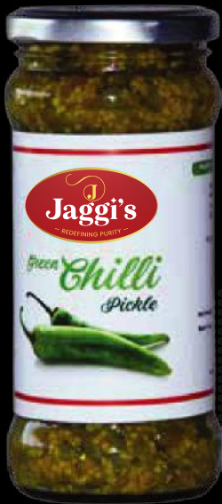
Green Chilli Pickle