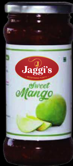
Sweet Mango Pickle