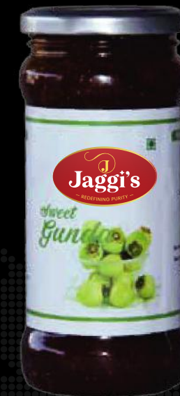
Sweet Gunda Pickle