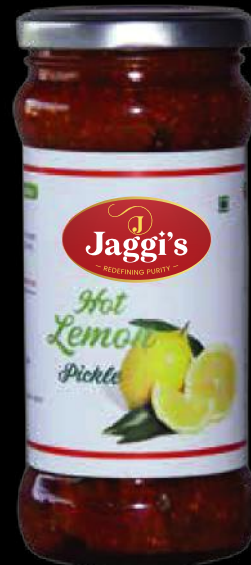
Hot Lemon Pickle