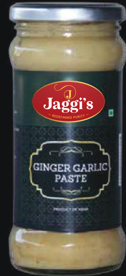
Ginger Garlic Paste