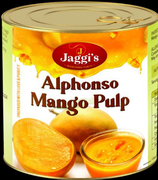
Alphonso Mango Pulp

Enjoy eating mangoes throughout the year, even if it is not the mango season, with our wide range of mango pulps. We choose the best mangoes to manufacture and export quality mango pulps to your kitchens. Our traditionally manufactured mango pulps give you the original mango taste. Our mango pulps include: