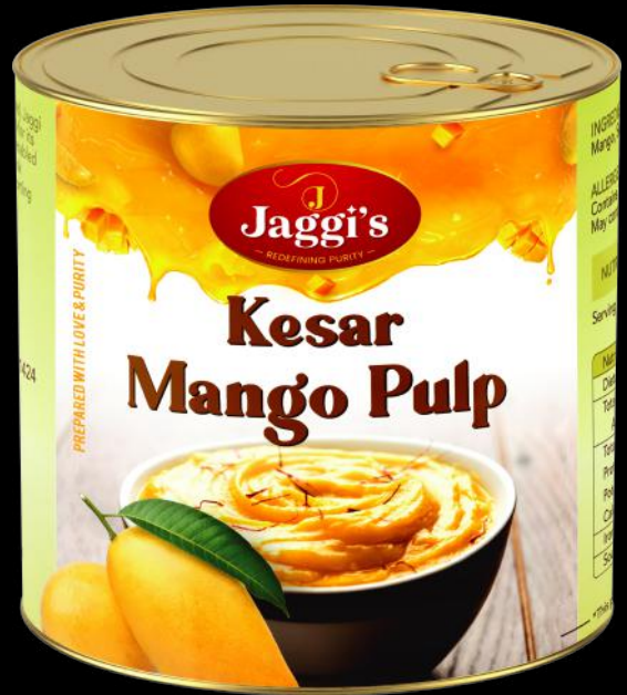
Kesar Mango Pulp