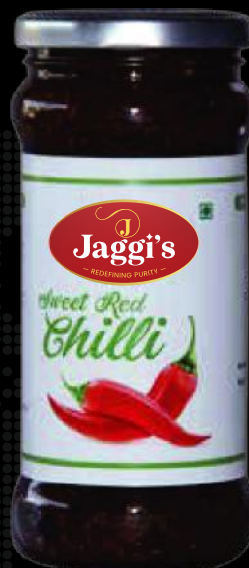
Sweet Red Chilli Pickle