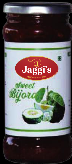
Sweet Bijora Pickle