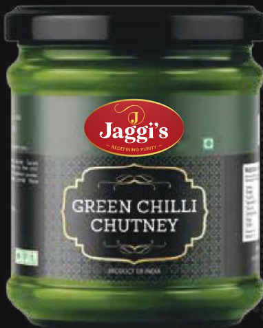
Green Chilli Chutney