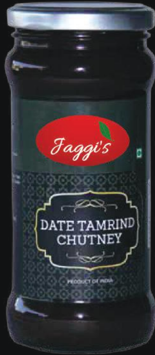
Date Tamrind Chutney

We have a range of traditionally made sour and spicy chutneys especially keeping the food lovers in mind. Our chutneys are available in multiple packages of different quantities as per the customer's requirements. Some of our tasty chutneys are: